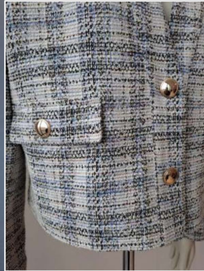
Novelty metal gold buttons