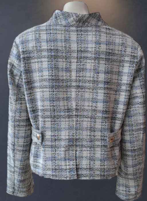
Back side view