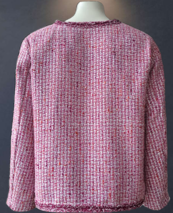
Back side view