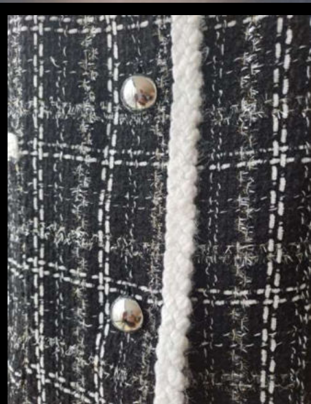
Novelty metal buttons