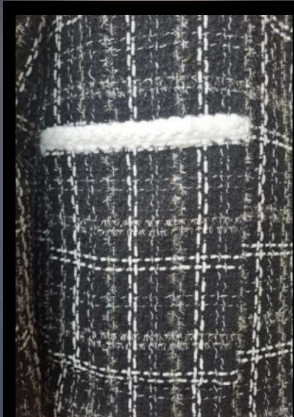
Novelty knitted lace