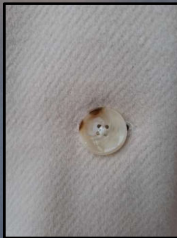
Fancy horn button