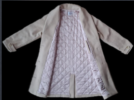
Lined inside with Diamond quilting