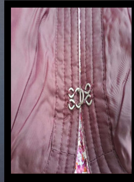
Invisible metal hook & eye