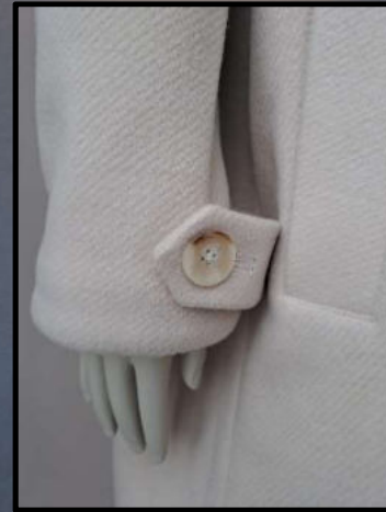
Styling at cuff