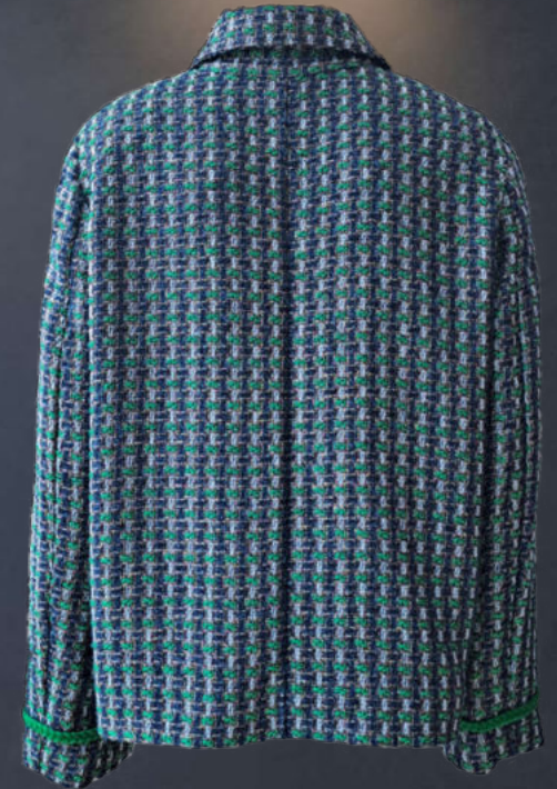
Back side view