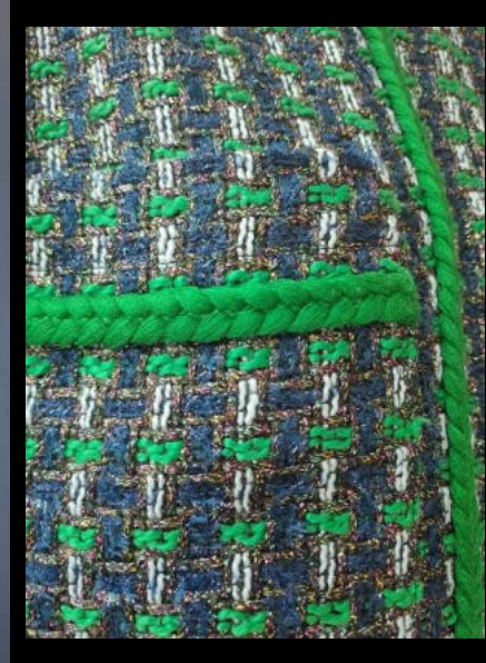
Novelty knitted lace