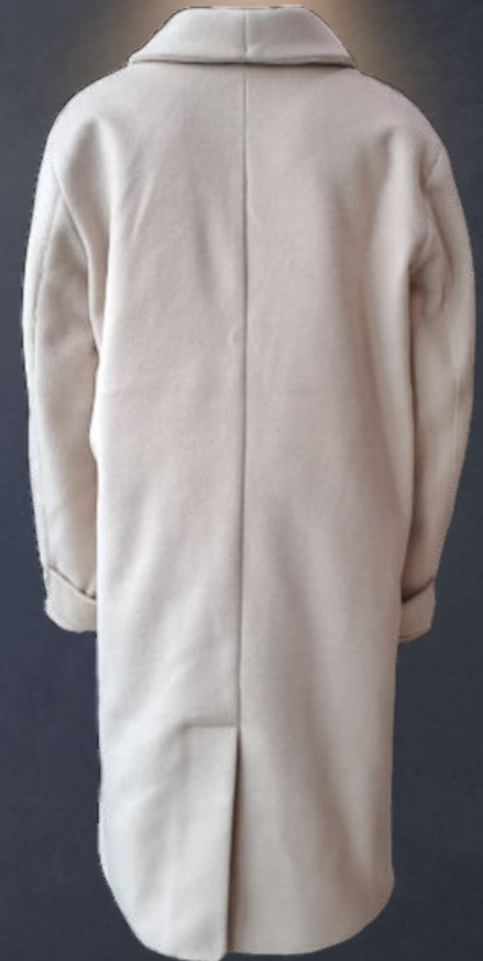
Back side view