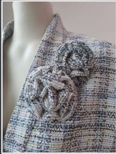
Floral motif in self fabric